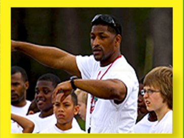
JUNIOR FOOTBALL TRAINING CAMP